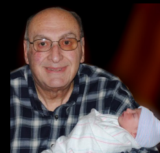
Am Yisrael Chai!